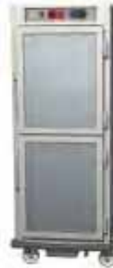
Full Height Dutch Clear Doors