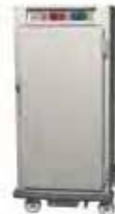
3/4 Height Full Solid Doors