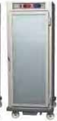
Full Height Full Clear Door