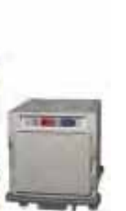
Under Counter Full Solid Door