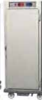
Full Height Full Solid Door