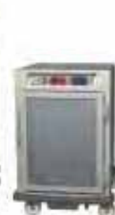
1/2 Height Full Clear Doors