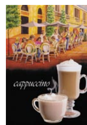
Model FMD-3 available with optional Cafe Display

Dimensions: 30"H x 11.3"W x 23.3"D (76.2 cm H x 28.7 cm W x 59.2 cm D)