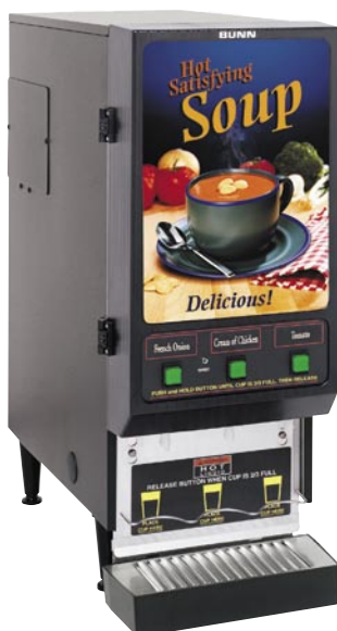
FMD-3 front display panel

Dimensions: 30"H x 11.3"W x 23.3"D (76.2 cm H x 28.7 cm W x 59.2 cm D)